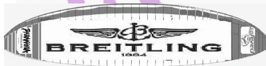
Sole & Platinum Sponsor Wing